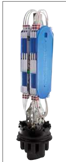
FRBU B-Length 11 Port Closure with 6 Medium Hellapon Trays