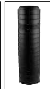
FRBU B-Length Closure Cover